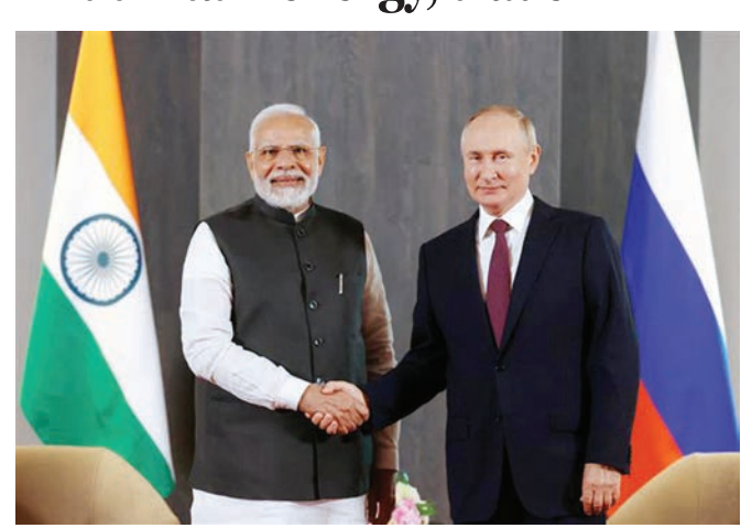
PM Narendra Modi and Russian President Vladimir Putin - File photo

Prime Minister Narendra Modi called up Russian President Vladimir Putin on Friday and said dialogue and diplomacy were the only solution to the conflict in Ukraine. They also touched on other areas of practical interaction such mutual investment, energy, agriculture, transport and logistics.