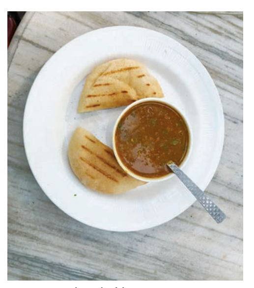
Portuguese bread with vegan soup at Laguna Anjuna.

houses that date back to the 18th and 19th centuries. Painted in hues of green, pale yellow, and blue, along with red-colored tiled roofs, artistic doors, and overhead balconies, you'll instantly fall head over heels with the rows of traditional Portuguese houses and cottages that cover the narrow, winding landscape. One of the intriguing features of the houses and cottages in Fontainhas is that