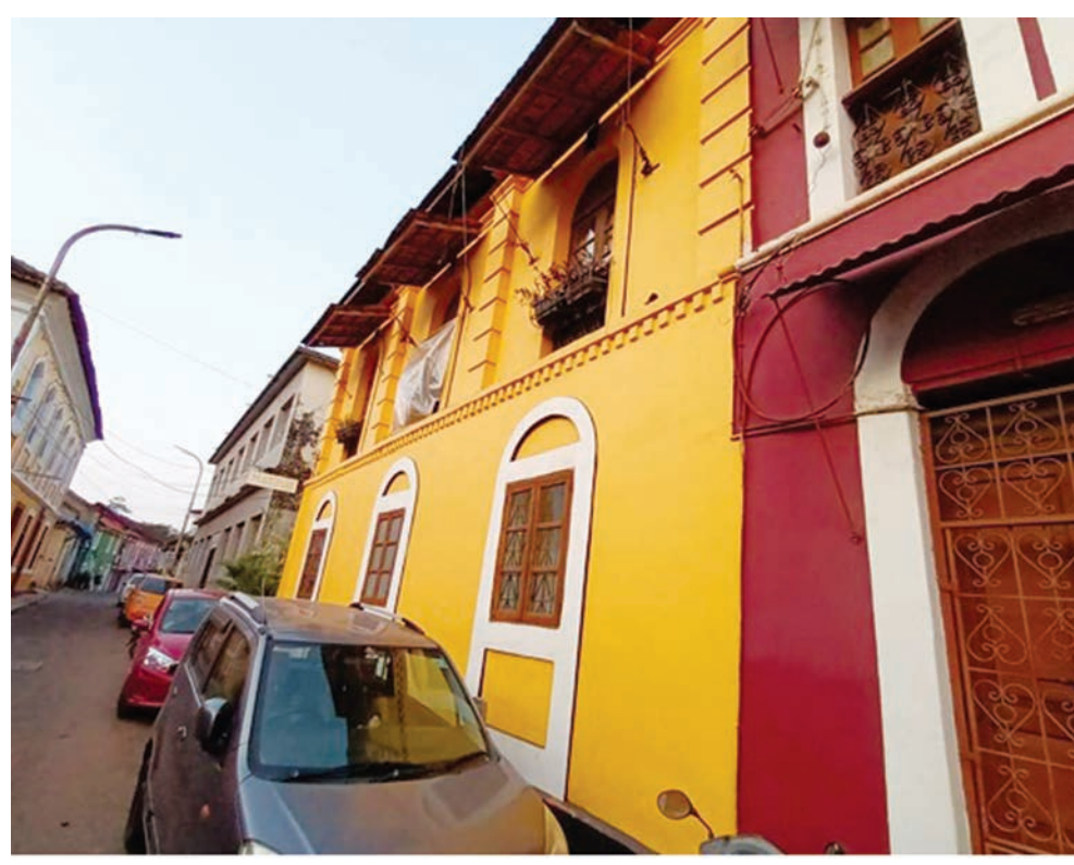
A Portuguese styled house on Fountainhas Street.