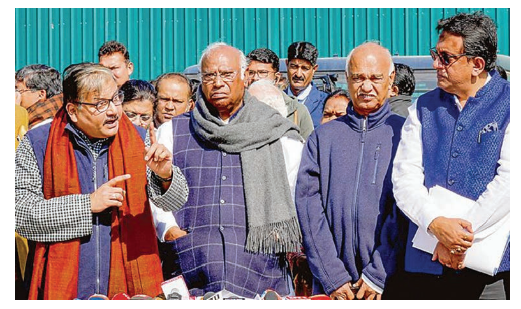
Congress president Mallikarjun Kharge and other leaders of the Opposition address the media outside Parliament in New Delhi on February 2, 2023