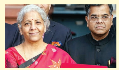
Finance Minister of India Nirmala Sitharaman